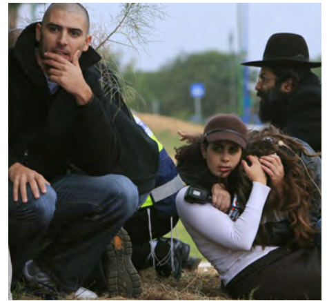
Israeli's take cover from Hamas rockets.