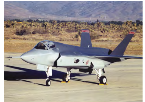
F-35 Joint Strike Fighter

Sustaining a strong military is expensive. For example, the U.S. F-35 Joint Strike Fighter, which Israel is seeking to