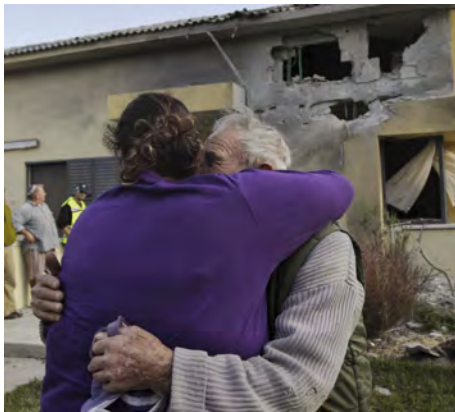
Hamas, with Iranian assistance, improved its ability to attack Israel.