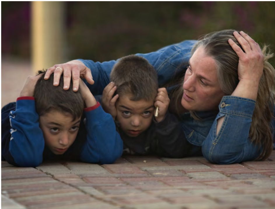
An Israeli mother and her sons in Kfar Aza try to shelter one another during a Hamas attack.

This is the story of one Israeli who continues to live on the border, on the edge and possibly still...within range.