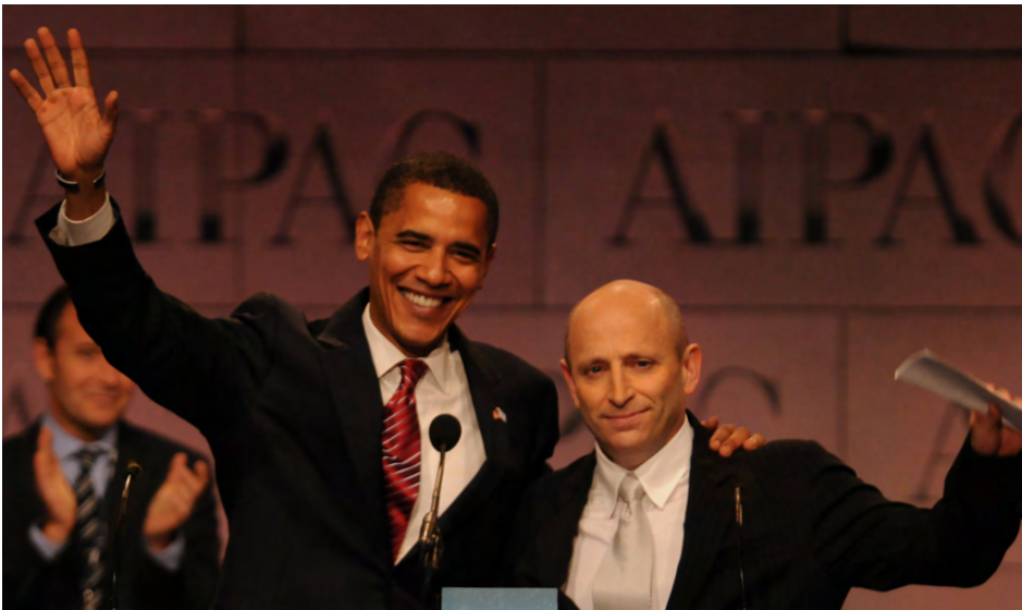
The AIPAC Policy Conference hosts numerous luminaries from both sides of the political aisle.

Join us at this year's AIPAC Policy Conference, May 3–5, 2009. E-mail us at: synagogue@aipac.org .